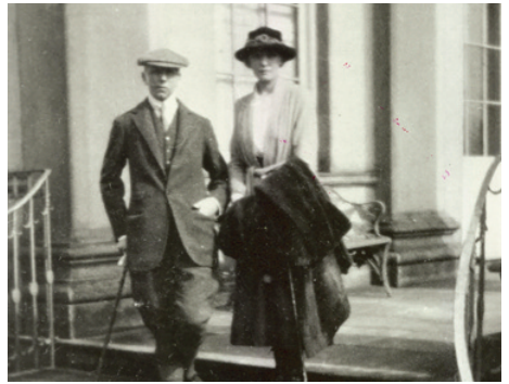
Lord and Lady Berwick on the steps of Attingham Hall, early 1920s

Clauses included the need for Lord Berwick to spend £250 on equipping the place with electric light; for the man who currently has the gardens to remove his crops to enable the garden to be cultivated; Mr Burdass purchases the billiard table for £90 from Lord Berwick, along with the Extoller for the table and two fenders from the billiard room at Attingham.